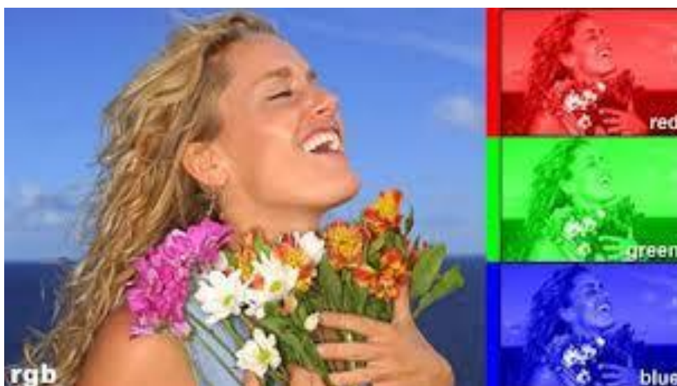
Fig 1.RGB image

The intensity of a pixel is expressed within a given range between a minimum and a maximum, inclusive. This range is represented in an abstract way as a range from 0 (total absence, black) and 1 (total presence, white), with any fractional values in between. This notation is used in academic papers, but this does not define what "black" or "white" is in terms of colorimetry. Converting RGB to grayscale/intensity. When converting from RGB to grayscale, it is said that specific weights to channels R, G, and B ought to be applied. These weights are: 0.2989, 0.5870, 0.1140. It is said that the reason for this is different human perception/sensibility towards these three colors.