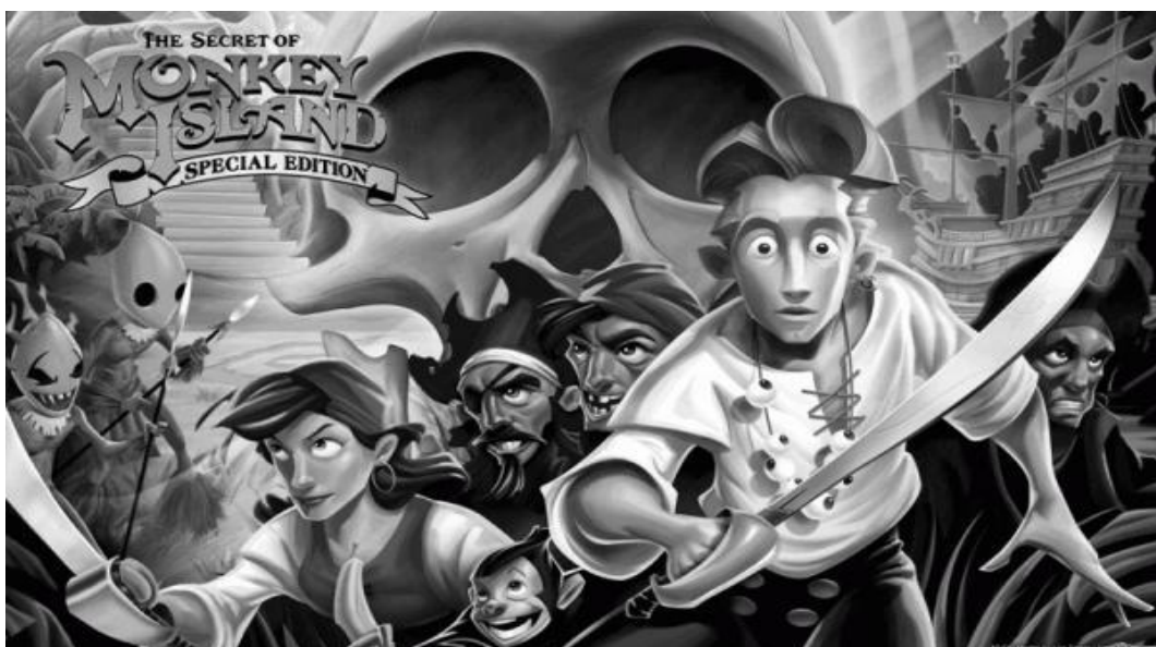
fig 6. luma

It’s hard to tell a difference between this image and the one above, so let me provide one more example.