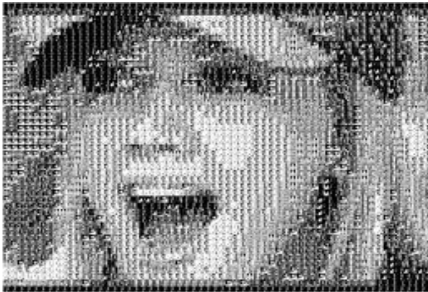
Fig 2.binary image

Binary images are typically obtained by thresholding a grey level image. Pixels with a grey level above the threshold are set to 1 (equivalently 255), whilst the rest are set to 0. This produces a white object on a black background (or vice versa, depending on the relative grey values of the object and the background). Of course, the 'negative' of a binary image is also a binary image, simply one in which the pixel values have been reversed.