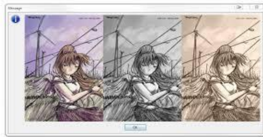
Fig 5.gray scale image to rgb image

For Each Pixel in Image { Red = Pixel.Red Green = Pixel.Green Blue = Pixel.Blue Gray = (Red + Green + Blue) / 3 Pixel.Red = Gray Pixel.Green = Gray Pixel.Blue = Gray }