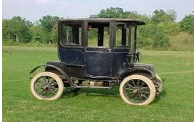
Fig.1 First solar car