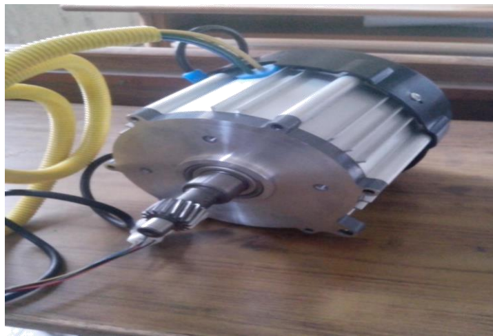
Fig.4 BLDC Motor