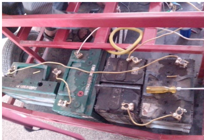
Fig.5 Battery Bank