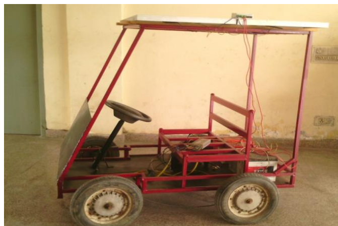
Fig.3 Solar Car

In this paper, the study of all previous works related to the electric and solar cars have been done. Solar powered vehicle is a three wheel drive and has been used for shorter distances. The main concentration was made on improving the design and making them cost effective. Energy from Sun is captured by the solar panels and is converted to electrical energy. The electrical energy thus obtained is being fed to the batteries that get charged and is used to run 24 V DC high torques DC series motor. The shaft of the motor is connected to the rear wheel of the vehicle through chain sprocket. The batteries are initially fully charged and thereafter they are charged by panels.